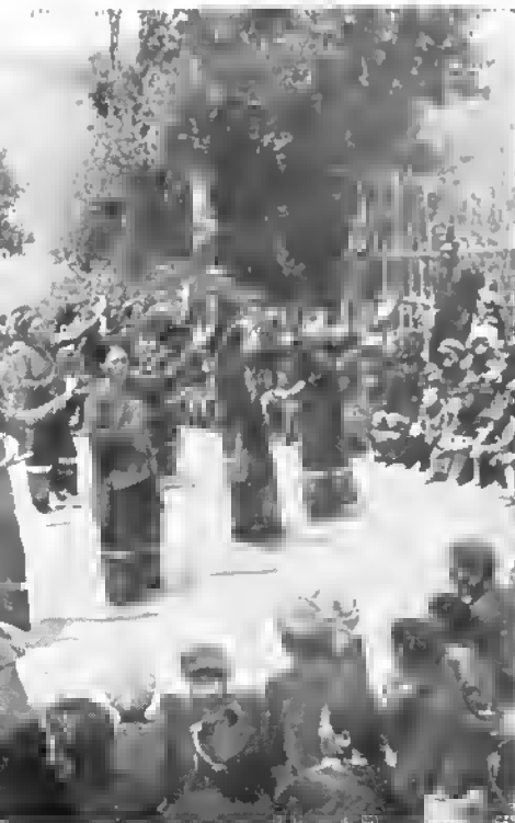
A Kutsung Mao Tsetung Thought propaganda team performs.

animals. For generations they did not see the sun. Then Chairman Mao sent the People's Liberation Army into the mountains to wipe out the remnants of the Kuomintang bandits and bring their liberation. P.L.A. comrades and local cadres of different nationalities spent the next five years on the difficult task of helping their Kutsung brothers move out of the deep mountain forests down to the good foothill country. There in 31 new villages built for them by the Party and People's Government they began a new life in 1957.